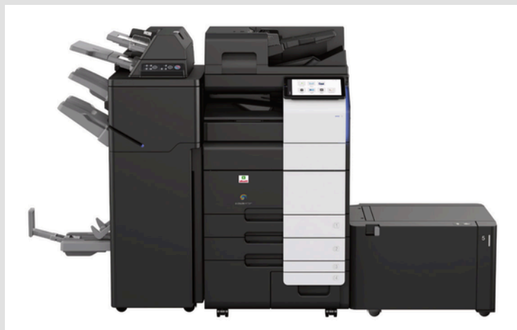
Configuration with FS-540SD Finisher and RU-519 Relay Unit; PI-507 Post Inserter; LU-205 Large Capacity Tray