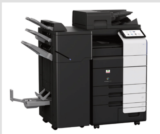
Configuration with FS-540SD Finisher and RU-519 Relay Unit; JS-602 Job Separator